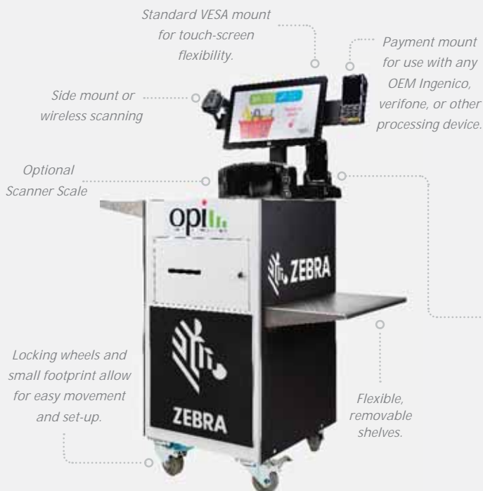
Standard VESA mount for touch-screen flexibility.