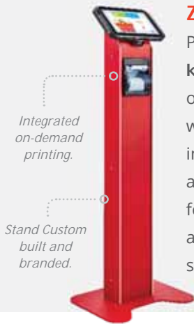
Integrated on-demand printing.