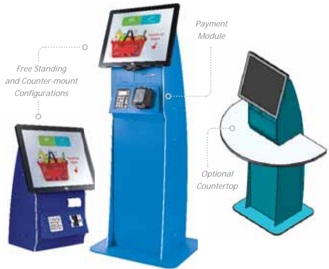
Free Standing and Counter-mount Configurations