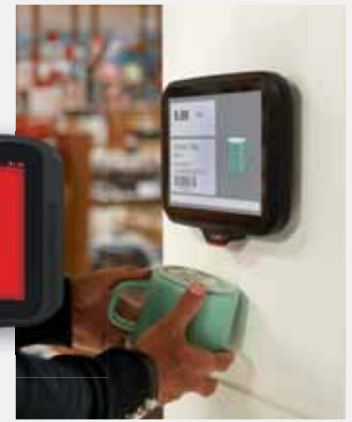
Free Standing, Wall mount, Counter and Shelf-mount options available.

Powered by the Zebra's CC6000 self-service kiosk, you can give shoppers the convenience of self-service transactions like price checks and wayfinding, allow them to browse your entire inventory instead of only what's on your shelves, and tie the CC6000 to your existing loyalty program for coupons and other offers. Empower shoppers to discover, browse and purchase all on their own with this ultra-compact, out-of-the-box self service kiosk solution.