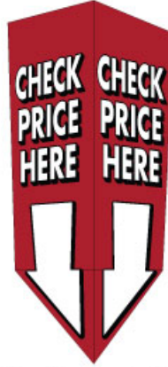
Three Sided Hanging Sign