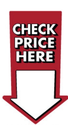
Two Sided Hanging Sign