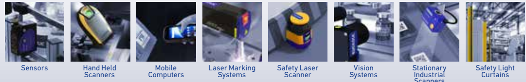
Sensors Hand Held Scanners Mobile Computers Laser Marking Systems Safety Laser Scanner Vision Systems Stationary Industrial Scanners Safety Light Curtains